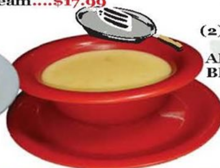
OUR HOUSE SIGNATURE WHITE CHILE CON QUESO!!