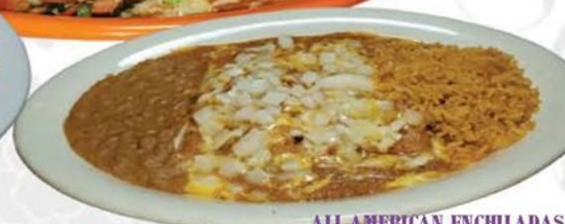
ALL AMERICAN ENCHILADAS

(Additional or Changes subject to extra charge)